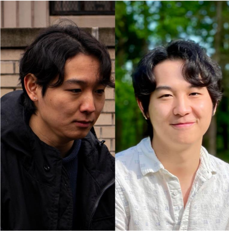
New York Times image (left) compared to LinkedIn profile picture (right)