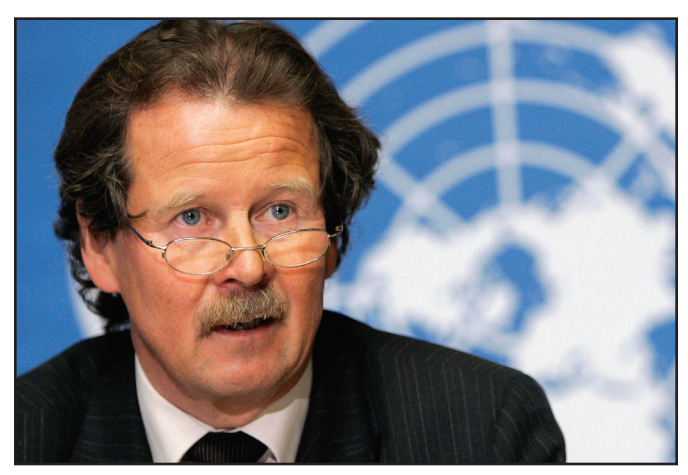
United Nations Special Rapporteur on Torture, Manfred Nowak

The use of torture against Falun Gong practitioners remains commonplace and continued throughout 2008. Amnesty International published several urgent actions on behalf of adherents at risk of torture, while the UN Committee Against Torture issued a binding decision calling for an independent investigation into abuse of Falun Gong adherents in custody.