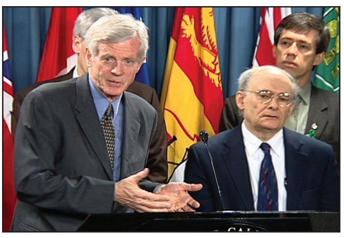
Canadian investigators David Kilgour and David Matas concluded in 2006 that organ harvesting allegations were true.

Additional information pointing to systematic forced organ removal from Falun Gong prisoners of conscience emerged in 2008, particularly the prevalence of suspicious medical testing.